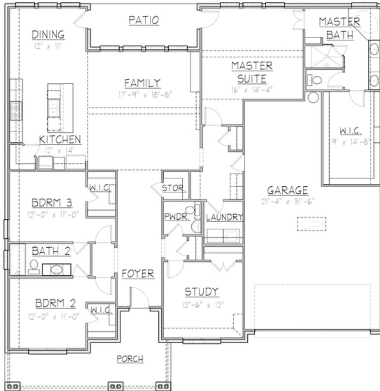
5001 FLOOR PLAN