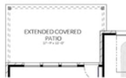
OPT. EXTENDED PATIO