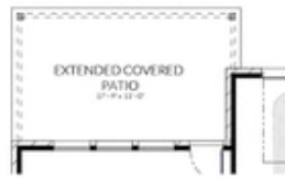
OPT. EXTENDED PATIO