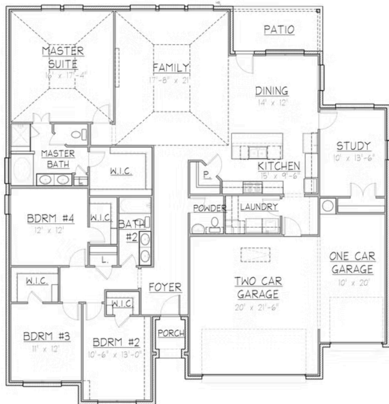
5000 FLOOR PLAN