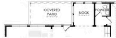
OPT. NOOK w/ EXTENDED PATIO